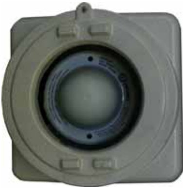
Figure 3. Antenna in Ex'd enclosure with window

The main hazard to be found with wireless networks is associated with the electrical hazard from the RF output stage. The hazard posed by electrical equipment has been catered for over many decades with the earliest standards and protection concepts now over 50 years old. The two key hazards are the risk of a spark when a device short circuits due to inadequate creepage and clearances or from a foreign body entering a piece of equipment. Ignition can also be caused by the heating effect of components conducting electrical current which are not adequately power rated.