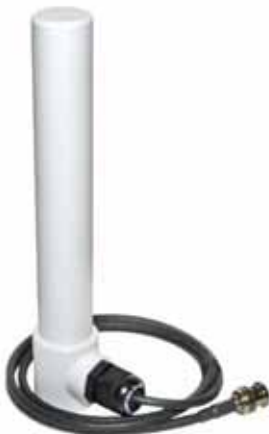
Figure 4. iANT100 Antenna

Another issue with this method is that the access point only directs RF power from the front of the enclosure (not in the case of glass dome Ex d enclosures), which will limit the flexibility of the device and also cause RF shadows in the close proximity of the unit. RF multi-path interference can also be created at higher frequencies which is an effect one seeks to avoid in deployments. However, although this method has its failings, it is cost effective and the Ex certification is very simple, so it does have its place!